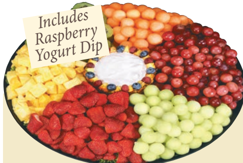
Includes Raspberry Yogurt Dip