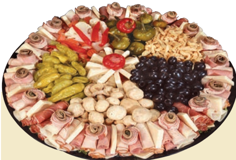
We recommend store baked Italian crispy rolls for this platter