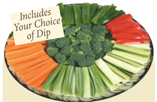
Includes Your Choice of Dip